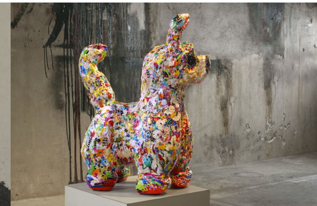
LILOU LADY DOG LOVABLE

Sabeth Holland, 2008 solid, polyurethane, fiberglass, acrylics, 22 carat gold, UV-protection, varnishes, on iron installation, raw 92 x 30 x 50 cm -> pages 9, 29