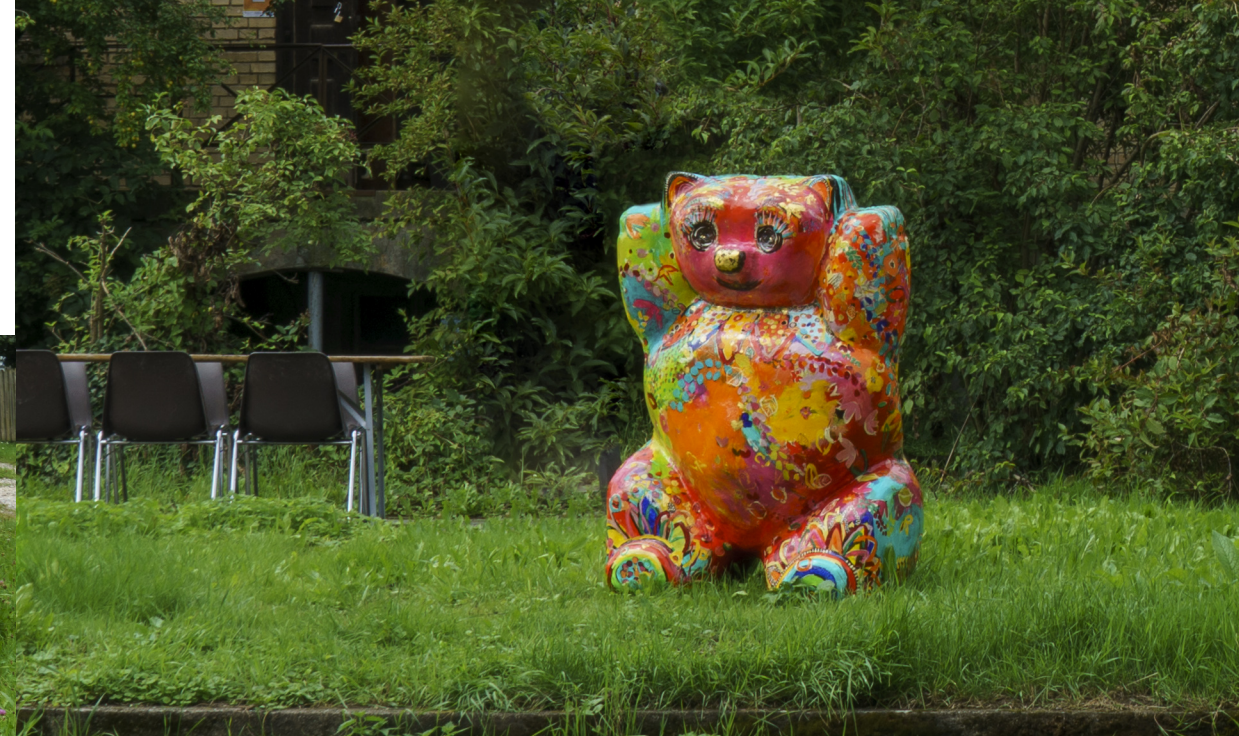
PRETTY PINK LOVABLE

Sabeth Holland, 2008 solid, polyurethane, fiberglass, acrylics, 22 carat gold, UV-protection, car varnishing, on steel reinforcements 90 x 70 x 130 cm -> page 37