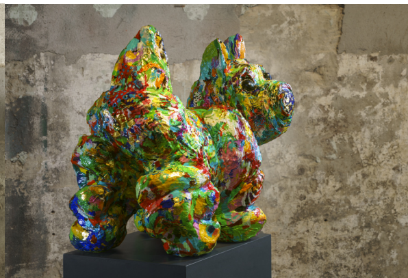
FAT DOG LOVABLE

Sabeth Holland, 2018 solid, polyurethane, steel acrylics, 22 carat gold, UV-protection, varnishes 30 x 26 x 30 cm -> page 14