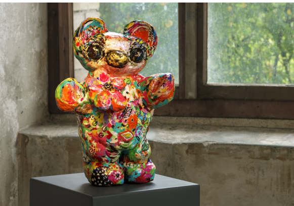
BLOOM BEAR LOVABLE

Sabeth Holland, 2018 solid, polyurethane, acrylics, 22 carat gold, UV-protection, varnishes 40 x 30 x 27 cm -> page 25