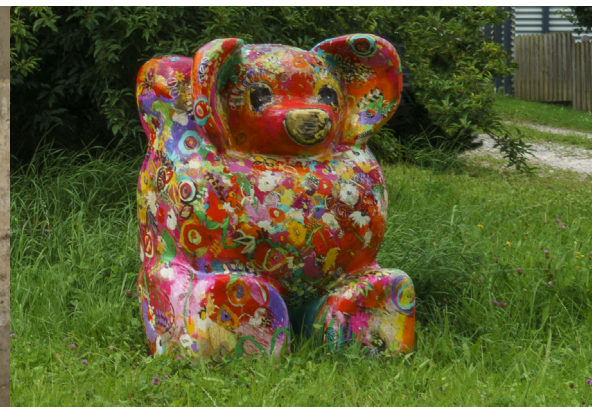
SWEET BLOSSOM LOVABLE

Sabeth Holland, 2020 solid, polyurethane, acrylics, 22 carat gold, UV-protection, varnishes 55 x 49 x 36 cm -> page 22