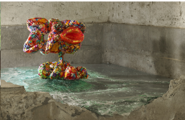
GINA FISH, SMILING

Sabeth Holland, 2018 solid, polyurethane, acrylics, 22 carat gold, UV-protection, varnishes 40 x 30 x 27 cm -> page 25