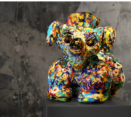
BLUE DOG LOVABLE

Sabeth Holland, 2020 solid, polyurethane, acrylics, 22 carat gold, UV-protection, varnishes 30 x 39 x 35 cm