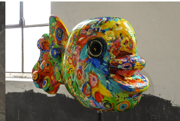
GREEN TREASURE FISH

Sabeth Holland, 2019 steel, aluminium, mortar, wire, PVC, polyurethane, acrylics, 22 carat gold, UV-protection, varnishes 100 x 100 x 170 cm -> pages 16, 17, 34