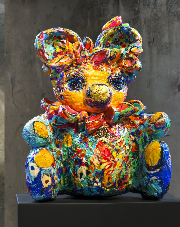
FLOWER FAIRY LOVABLE

Sabeth Holland, 2021 solid, polyurethane, acrylics, 22 carat gold, UV-protection, varnishes 50 x 92 x 83 cm -> pages 18, 36 and cover